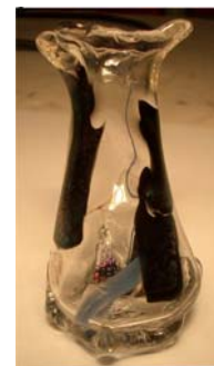
The glass working temperature is approx 1120 degrees. This is Bulls eye.