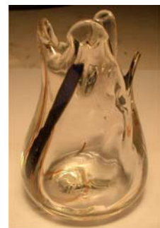
A small glory hole is used to shape the glass.