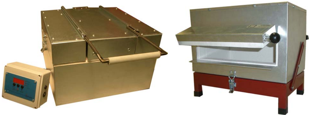
A small beadannealer works well for cooling the glass.